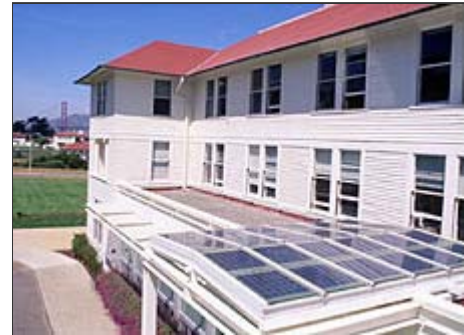
The Thoreau Institute of Sustainability at the Presidio—San Francisco, California

In the struggle to build cost-effective buildings , it is easy to forget that the ultimate success or failure of a project rests on its indoor environmental quality (IEQ). Healthy, comfortable employees are invariably more satisfied and productive . Unfortunately, this simple, compelling truth is often lost, for it is simpler to focus on the first-cost of a project than it is to determine the value of increased user productivity and health. Federal facilities should be constructed with an appreciation of the importance of providing high-quality, interior environments for all users.