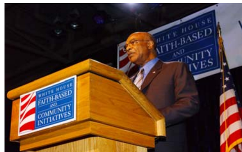
Secretary Rod Paige, of the US Department of Education, offered the keynote address at the WH Conference in Minneapolis.

The White House, together with the Departments of Justice, Agriculture, Labor, Health & Human Services, Housing & Urban Development, and Education, and the Agency for International Development, recently held a Faith-Based and Community Initiatives conference in Minneapolis, MN. The conference is part of a series to help grassroots organizations learn more about President Bush's Initiative. These free, day-long conferences have equipped more than 8,400 community leaders with information about the Federal funding process, government grants that are suited to their needs, and the legal issues that may apply to recipients of Federal funds. The next White House conference is taking place in Memphis, TN, on October 29. Visit www.fbc.gov for more info about the conferences.