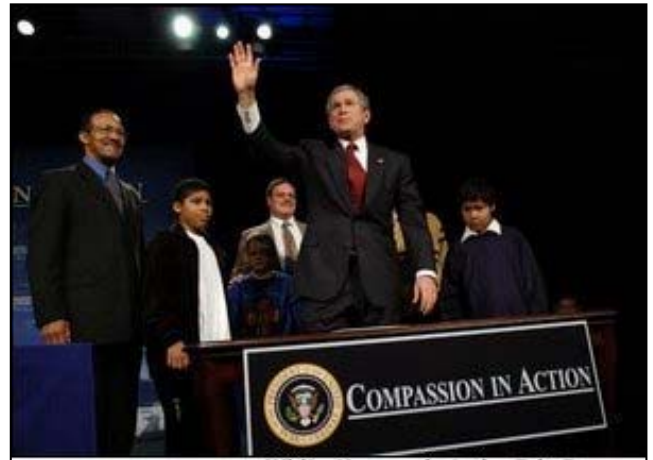
President Bush signed Executive Orders as Amachi program mentors and their students observed.

Visit www.fbc.gov to access links to the FBCI Cabinet Center websites.