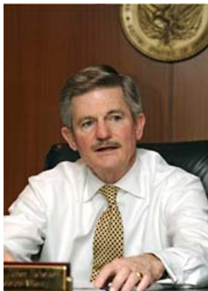
U.S. Secretary of Veteran Affairs Jim Nicholson

The U.S. Department of Veterans Affairs (VA) Center for Faith-Based and Community Initiatives (CFBCI) collaborated with VA Healthcare for Homeless Veterans (HCHV) and coordinators of programs for the homeless to create Restored Vision, a one year pilot program which will provide eyeglasses to homeless veterans in five locations throughout the United States.